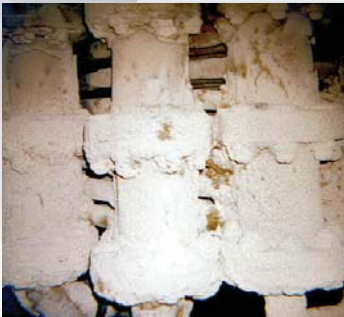
Marine Freshwater Evaporator