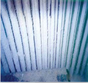
Food Processor Evaporative Condenser