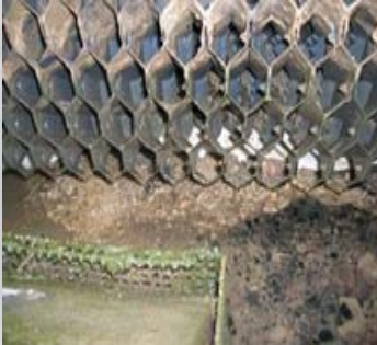
Injection Molding Cooling Tower