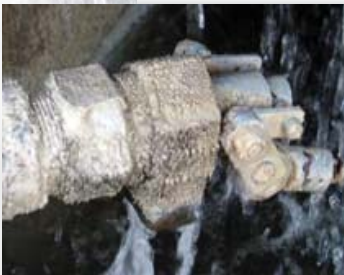
Bakery Evaporative Condenser Float Valve